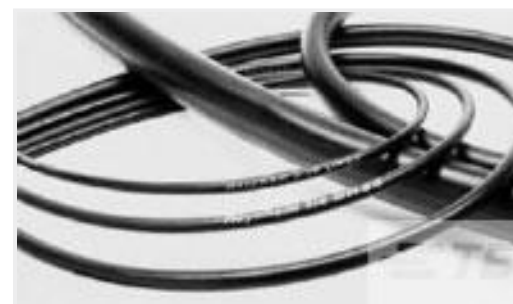
TE Part #5039304024 DR-25-1/2-0-SP