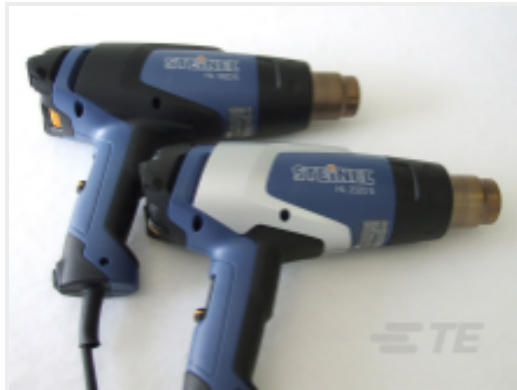
TE Part # EG8162-000 HL1920E-230V-EURO