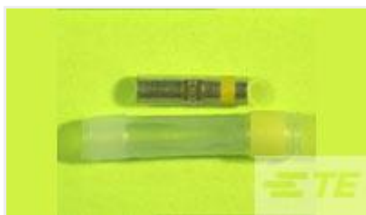
TE Part #650076-000 D-436-38