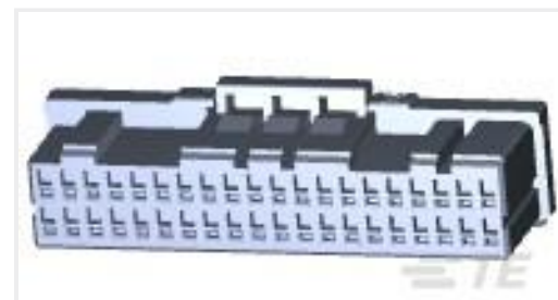
TE Part #1-1827863-0 DYNAMIC 1100D REC HSG X 40P BL