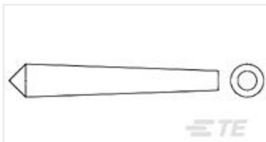
TE Part #770678-1 SEAL PLUG, AMPSEAL