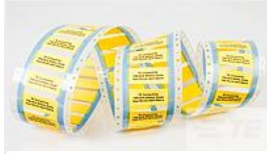
TE Part #7385170001 TMS-SCE-1K-1/2-2.0-9