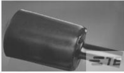
TE Part #CX7198-000 RHW-16/4-1200/ADH-0