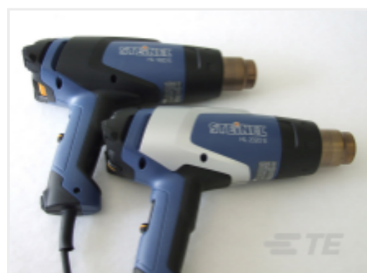
TE Part # EG8162-000 HL1920E-230V-EURO