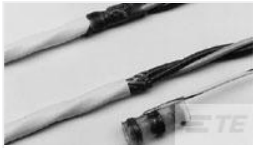
TE Part #A88975-000 B-155-07