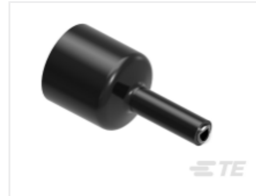
TE Part #NB07394001 HTAT-12/3-0-SP