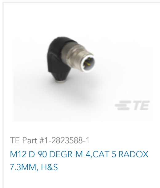
TE Part #1-2823588-1 M12 D-90 DEGR-M-4,CAT 5 RADOX 7.3MM, H&S