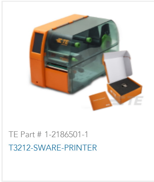
TE Part # 1-2186501-1 T3212-SWARE-PRINTER