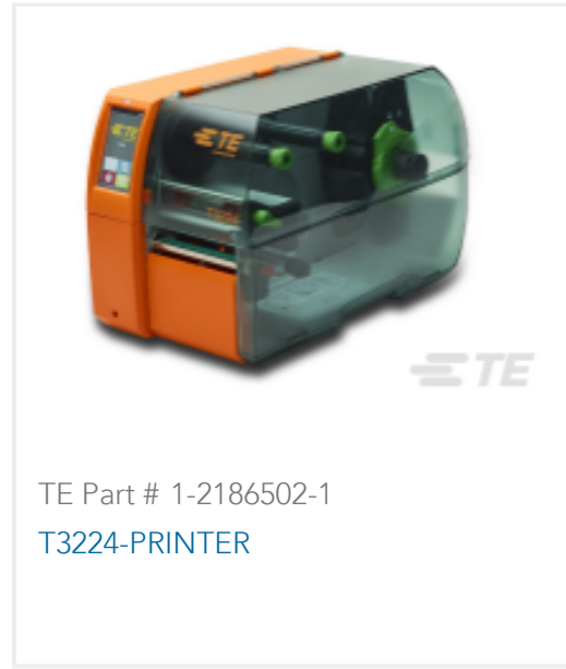
TE Part # 1-2186502-1 T3224-PRINTER