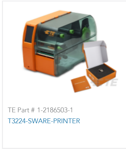
TE Part # 1-2186503-1 T3224-SWARE-PRINTER