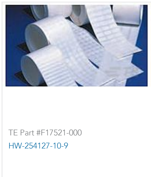
TE Part #F17521-000 HW-254127-10-9