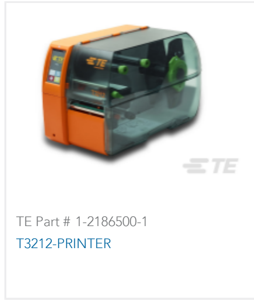
TE Part # 1-2186500-1 T3212-PRINTER