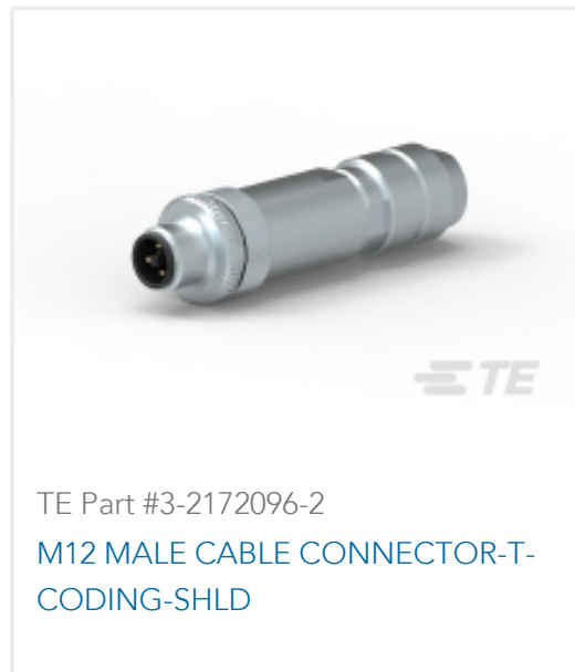
TE Part #3-2172096-2 M12 MALE CABLE CONNECTOR-T- CODING-SHLD