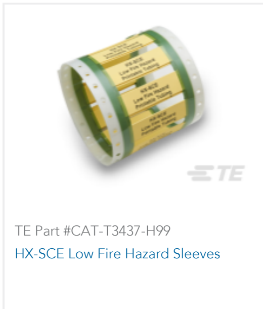
TE Part #CAT-T3437-H99 HX-SCE Low Fire Hazard Sleeves