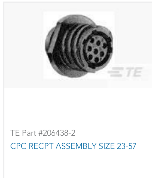
TE Part #206438-2 CPC RECPT ASSEMBLY SIZE 23-57