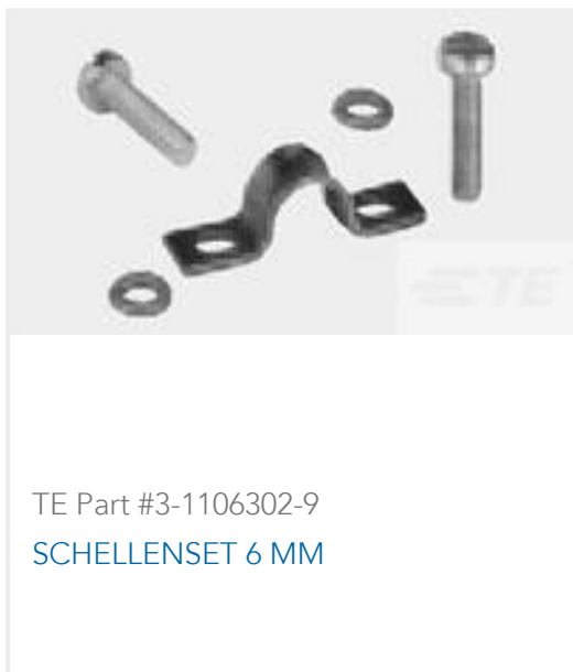
TE Part #3-1106302-9 SCHELLENSET 6 MM