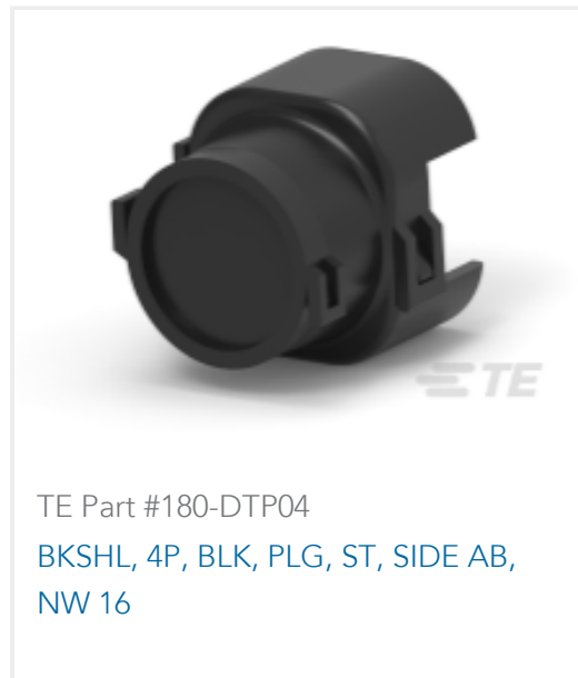
TE Part #180-DTP04 BKSHL, 4P, BLK, PLG, ST, SIDE AB, NW 16