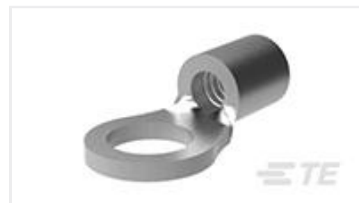
TE Part #130106 TERM, RT, SOLIS, 16-14, M5