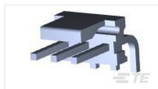
TE Part #640389-3 03P MTA156 HDR ASSY SQ R/A F/L