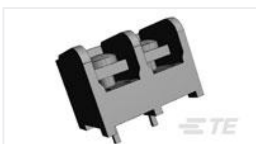
TE Part #3-1437652-9 6PCV-02-006=6PCV ASSEMBLY