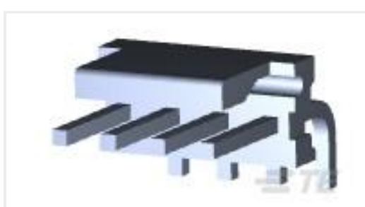
TE Part #640389-4 04P MTA156 HDR ASSY SQ R/A F/L