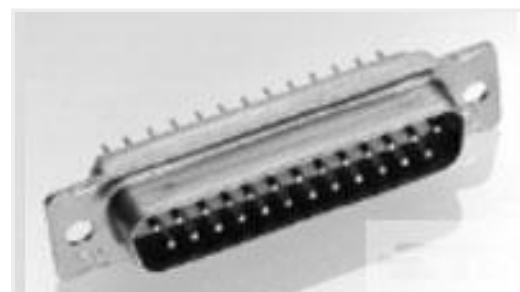
TE Part #1757823-9 AMPLIMITE,ASY,PLUG,STD,90,ZN,3,CT