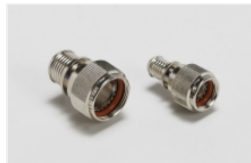
Unscreened Backshells & Adapters(25)