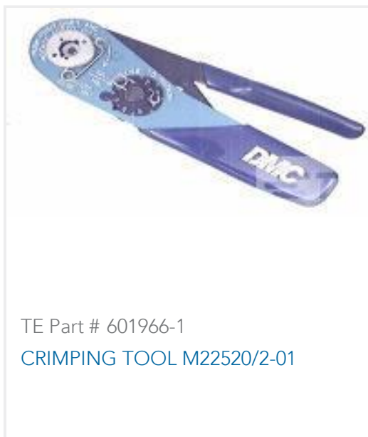
TE Part # 601966-1 CRIMPING TOOL M22520/2-01