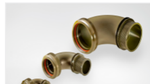
TE Part #AAF7097-00 BTH3-25-19-1-B-SE