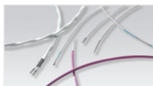
TE Part #CAT-55A-TC-H14 General Purpose Hookup Wire: Tin Coated Copper Wire, 14 AWG