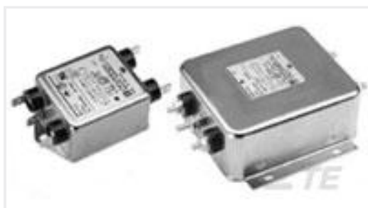
TE Part #6609044-1 3VW1=F7254 S0