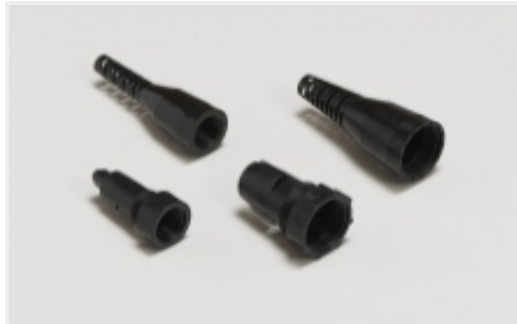
Connector Strain Relief(16)