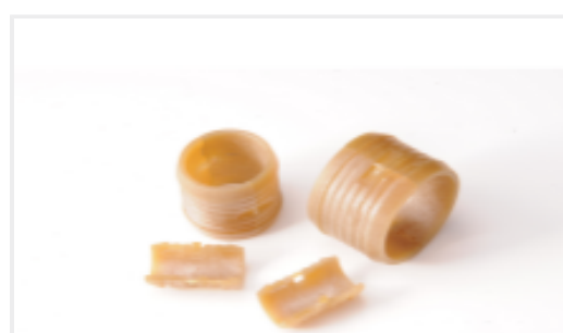
TE Part #AAE3178-00 BND-SR-18