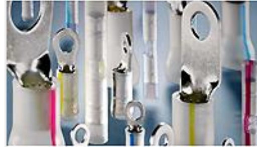
TE Part #53414-1 TERMINAL,PIDG PVF2 R 16-14 4