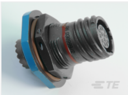
TE Part #YDTS24T25-61SNV001 RECP ASSY