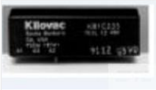
TE Part #1618222-8 AP10AB57=RELAY, VACUUM, SPST-N