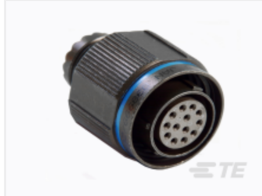
TE Part #YDTS26T09-98SAV001 PLUG ASSY