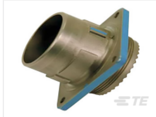
TE Part #YDIV46E19-32SNC009 PLUG ASSY