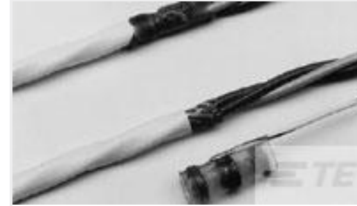
TE Part #683123-000 S03-08-R-100HN