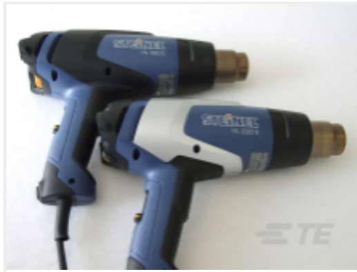
TE Part # EG8162-000 HL1920E-230V-EURO