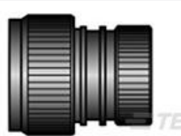
TE Part #600924-000 HEXA6-AC-00-02-A25-1