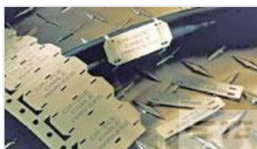
TE Part #0076930001 CM-SCE-1/2-4H-9