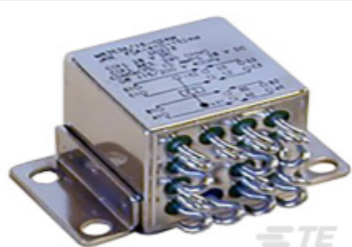
TE Part #8-1617808-0 TD229-9002P= TDFR 90 SEC M83726 /29-9002P