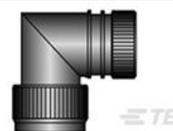
TE Part #012481-000 HEX40-AC-90-13-A3-C