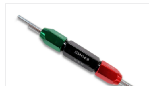
TE Part #525441-6 PLUG GAUGE, HANDTOOL