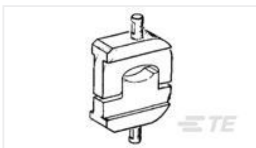
TE Part #69216 HYP8/10 SOLIS 8AWG DIE SET