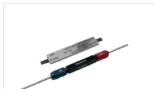
TE Part #525446-2 SLIP GAUGE, HANDTOOL