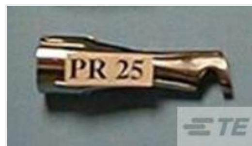
TE Part #991965-000 PR-25-REFLECTOR