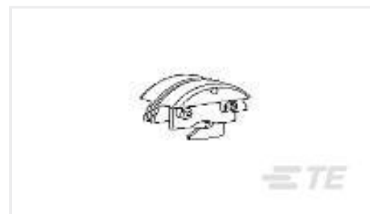
TE Part #1490414-1 HYP10 SOLIS 8AWG INDENTER