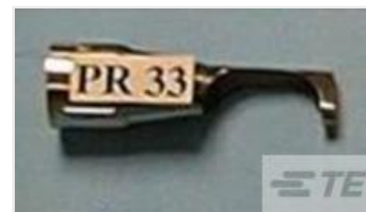
TE Part #997768-000 PR-33-REFLECTOR