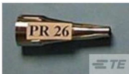
TE Part #991967-000 PR-26-REFLECTOR