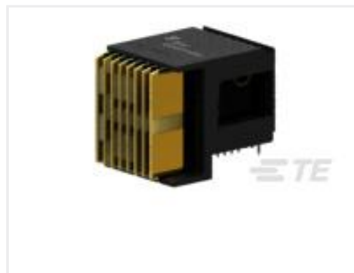
TE Part #2102772-1 DC, 7Row, Half Left End, MULTIGIG RT 2R