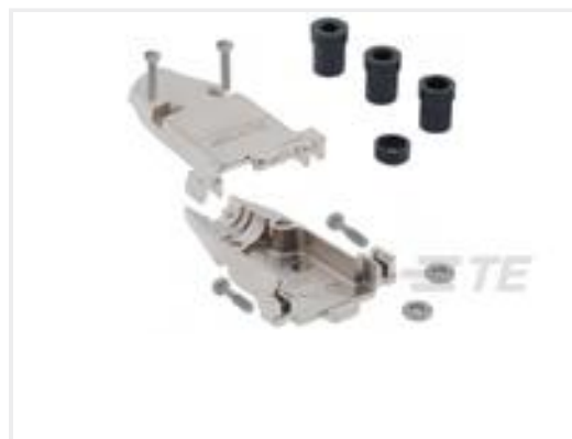
TE Part #5748676-1 DIE CAST CBL CLMP KIT, SZ 1