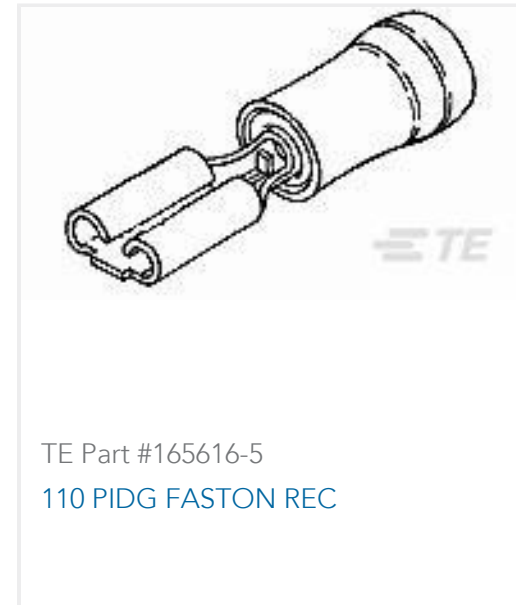
TE Part #165616-5 110 PIDG FASTON REC