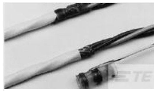
TE Part #625250-000 D-128-0008