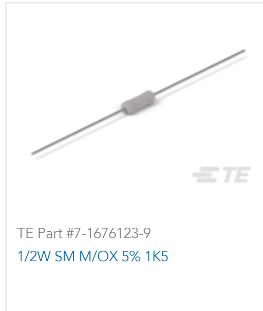
TE Part #7-1676123-9 1/2W SM M/OX 5% 1K5