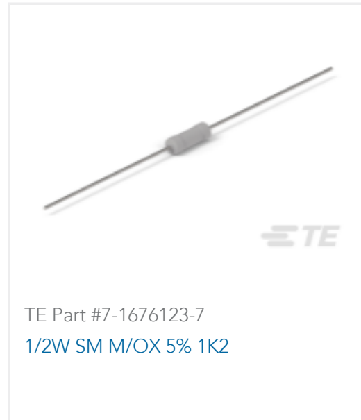
TE Part #7-1676123-7 1/2W SM M/OX 5% 1K2