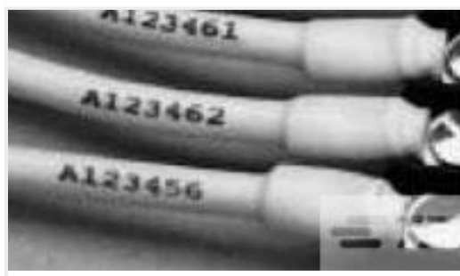
TE Part #5054324002 RNF-100-1-1/2-3-SP