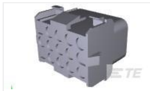
TE Part #926647-2 15P UN-MNL AUFN-GEH