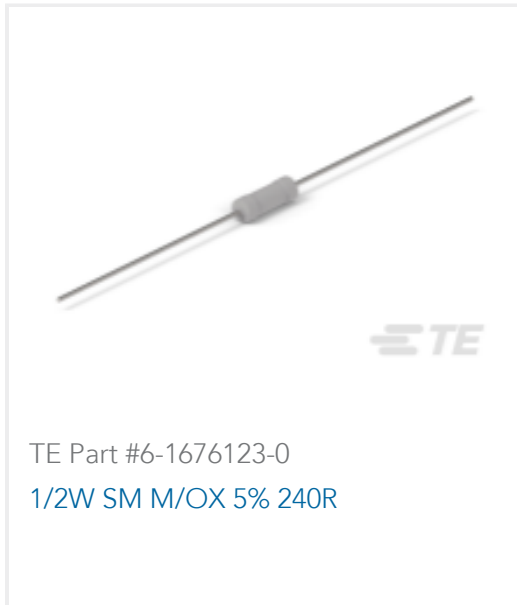
TE Part #6-1676123-0 1/2W SM M/OX 5% 240R