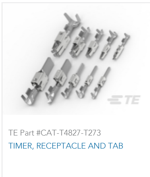
TE Part #CAT-T4827-T273 TIMER, RECEPTACLE AND TAB