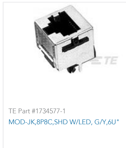
TE Part #1734577-1 MOD-JK,8P8C,SHD W/LED, G/Y,6U"