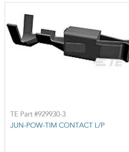
TE Part #929930-3 JUN-POW-TIM CONTACT L/P