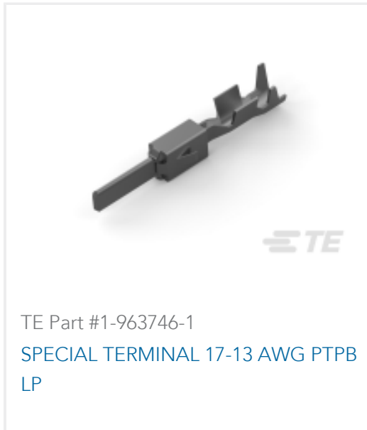
TE Part #1-963746-1 SPECIAL TERMINAL 17-13 AWG PTPB LP