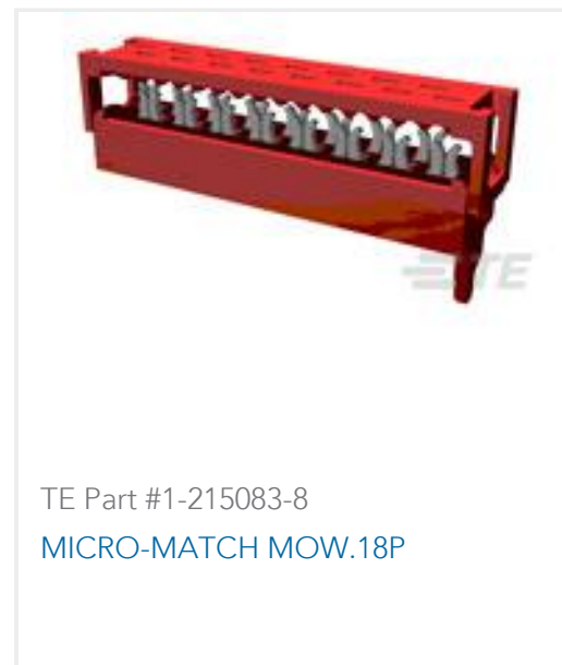
TE Part #1-215083-8 MICRO-MATCH MOW.18P