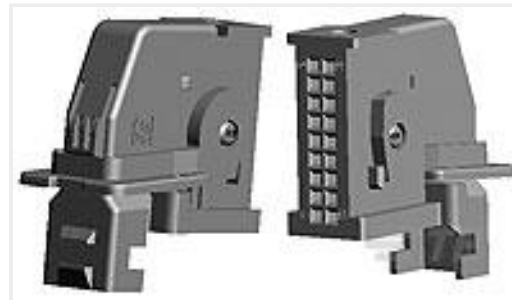
TE Part # 1379101-1 COV+LEV MQS 18W 90DEG BLK