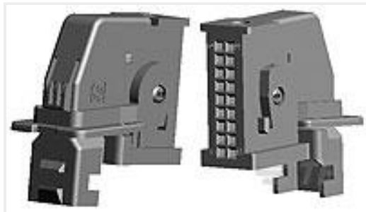
TE Part # 1379101-2 COV+LEV MQS 18W 90DEG WHI