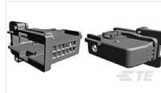
TE Part # 1379100-1 COV+LEV MQS 18W 0DEG BLK