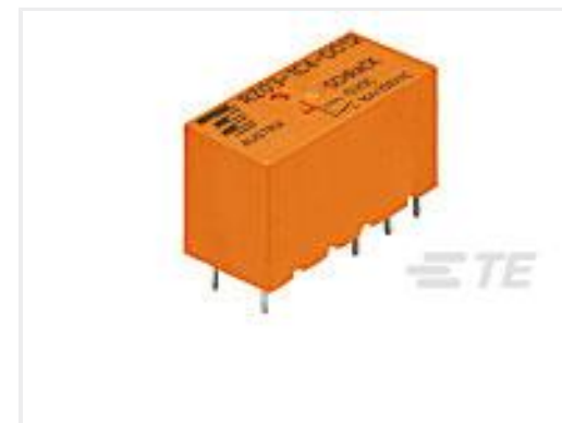
TE Part #1415899-5 RZ01-1A4-D024