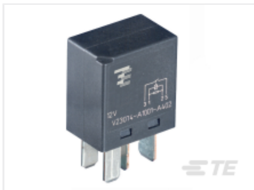
TE Part #4-1904124-2 V23074A1001A402-EV-CBOX