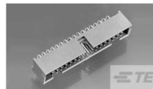
TE Part #5104340-1 A/L LOW PRO HDR 10P RA HT