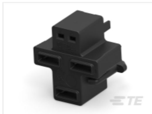
TE Part #2413902-1 HVA HD400 180D HEADER PCB COVER