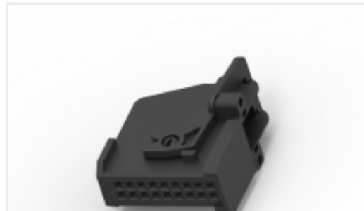
TE Part # 1670903-1 SHIELD.SHELL,0,18 W MQS FRAME, ASSY