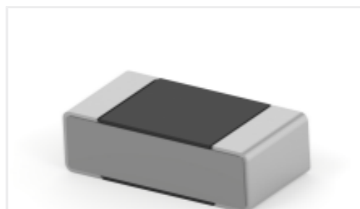
TE Part #5-1879125-1 RN 0402 75R 0.1% 10PPM 5K RL