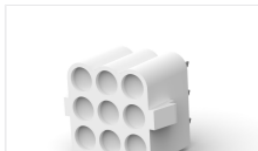
TE Part #365046-1 09P.M-N-L.PIN HDR.