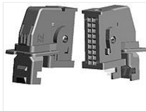
TE Part #1379101-1 COV+LEV MQS 18W 90DEG BLK