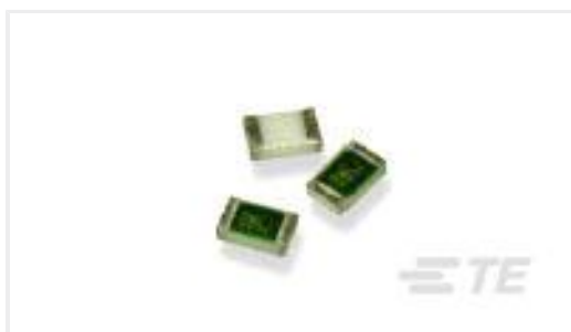
TE Part #5-1879208-0 CPF 0402 1K1 0.1% 25PPM 1K RL