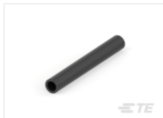
TE Part #CAT-HST-HTAT HTAT Heat Shrink Tubing