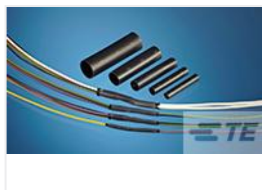
TE Part #CH03056001 QSZH-125-NR4-75MM