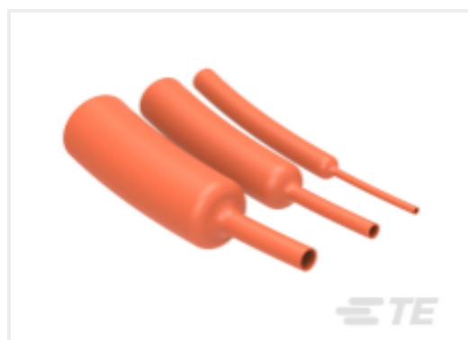
TE Part #CAT-HST-CGPT1 CGPT 2:1 Heat Shrink Tubing