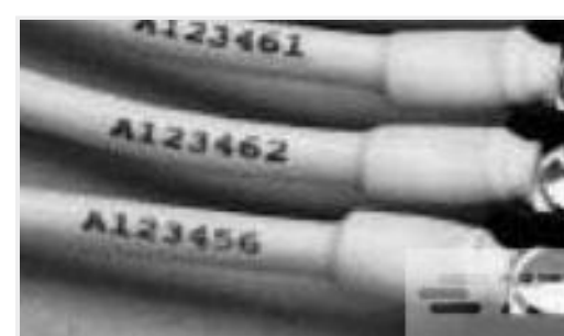
TE Part #5053394020 RNF-100-2-0-SP