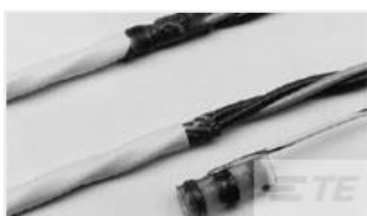
TE Part #611430-000 SO96-4-01