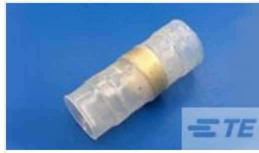
TE Part #881945-000 B-053-70-05