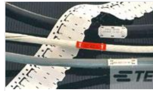
TE Part #3576550001 HTCM-SCE-1/4-4H-9