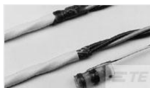
TE Part #133962-000 SO63-2-01