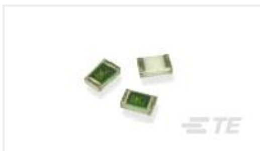
TE Part #7-1879133-9 RN 0603 5K76 0.1% 10PPM 1K RL