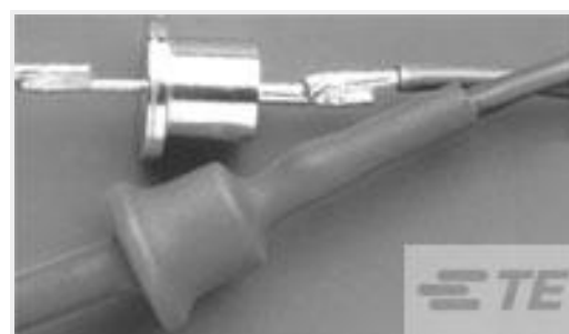
TE Part #2729012002 RNF-3000-18/6-6-STK