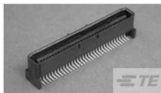
TE Part #5146888-1 1FHP,64,30A/S,S,C,S10,12,13,15