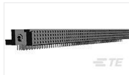
TE Part #532434-6 HDI RECP ASSY 4 ROW 180 POS