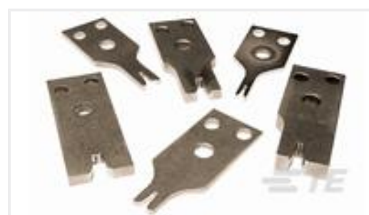
TE Part #1338210-3 CRIMPER, MODIFIED