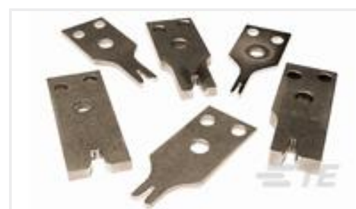
TE Part #1338210-2 CRIMPER, MODIFIED