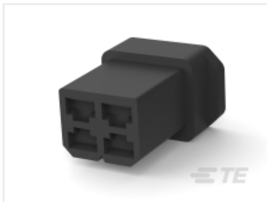
TE Part #626056-4 FASTIN-ON .110 HOUSING REC PRETO/BLACK