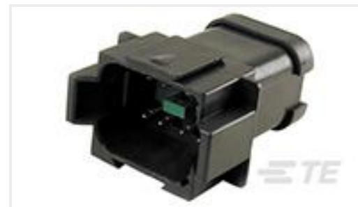
TE Part #DT04-08PB-P021 REC, 8P, BLK, BUSBAR 1X8, NICKEL, B