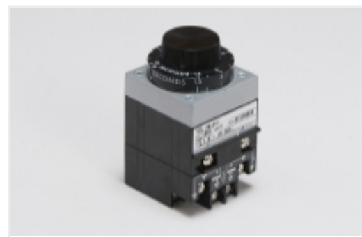
Time Delay Relays(39)