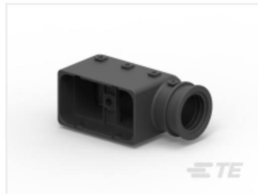
TE Part #0528-007-6005 BKSHL, 60P, BLK, PLG, RA, SIDE, NW 26