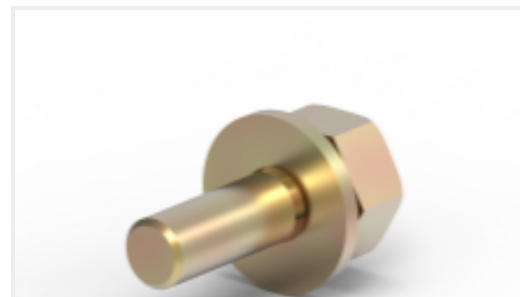
TE Part #HC5881 BAT 1/4" UNC BOLT/WASHER ASSMB