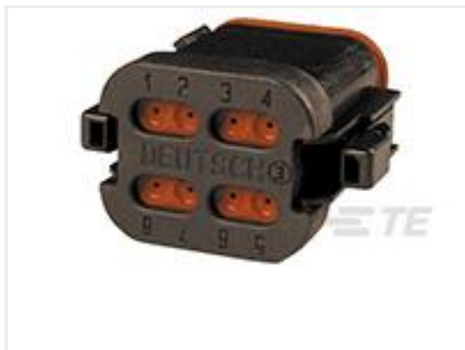
TE Part #DT06-08SB-CE05 PLG, 8P, BLK, E, SEAL RET, CAP, B