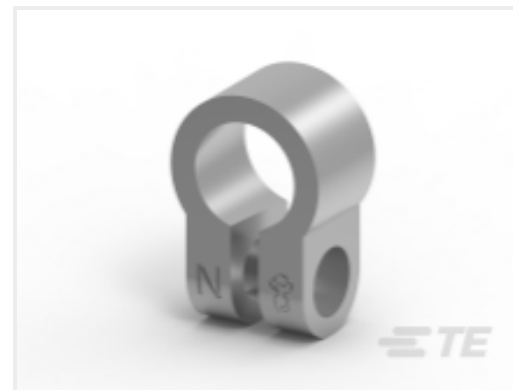
TE Part #HC5884 STANDARD BAT CLMP NEGATIVE