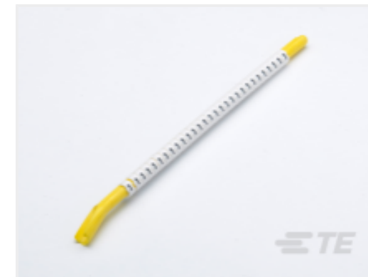
TE Part #CAT-T3437-ST2999 STD Snap-On Markers