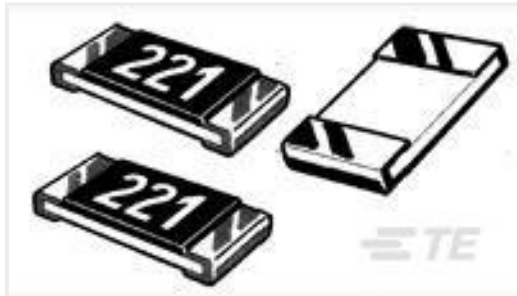
TE Part #7-2176230-4 3522 1M0 5% 3W