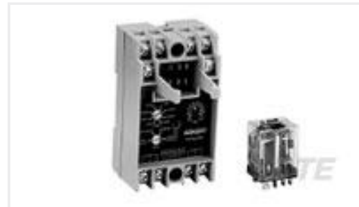
TE Part #1423167-2 SSFR90A=UNIV. TIMER 120V