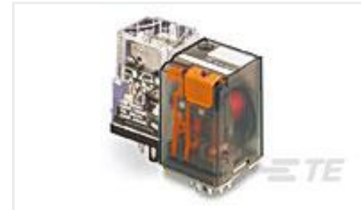
TE Part #7-1393104-7 KRPA-14AY-120=KRPA