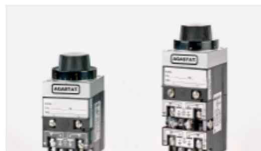
TE Part #5-1423157-2 7012AHM=RLY,STD,ON,2P,120VAC