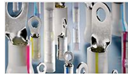
TE Part #696423-4 TERMINAL,PIDG PVF2 R 16-14 6