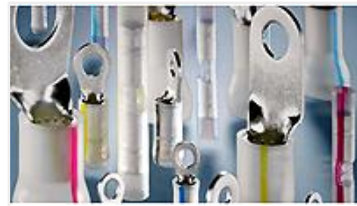
TE Part #53548-1 SPLICE BUTT PVF2 PIDG 22-16