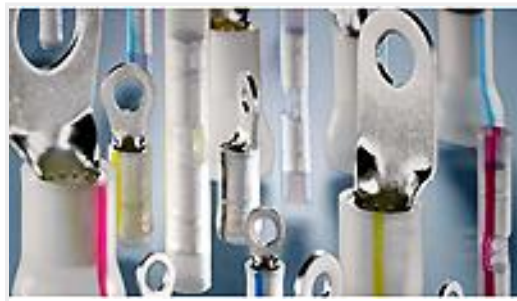
TE Part #53416-1 TERMINAL,PIDG PVF2 R 16-14 6