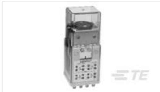
TE Part #1423156-1 GPI=RLY,120VAC