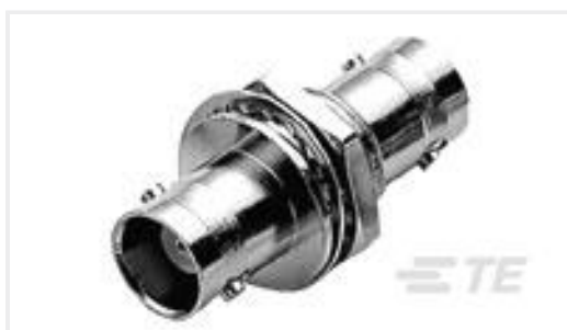
TE Part #222117-1 ADAPTER,JACK,BHD,75 OHM,BNC