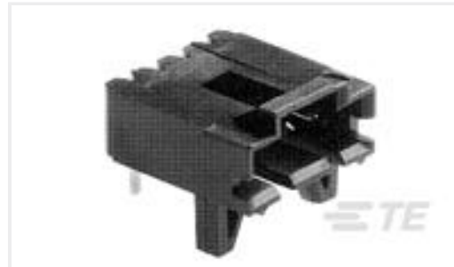
TE Part #5-103673-4 5 MTE HDR SRRA LATCH W/HLDWN