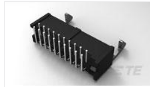
TE Part #1761607-3 IDC LOW PRO HDR 10P RA LAT