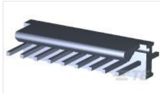
TE Part #640456-9 09P MTA100 HDR ASSY F/L SQ STR