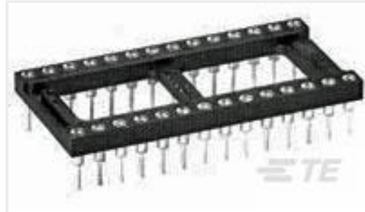
TE Part #4-1437537-0 816-AG11D=SOCKET ASSEMBLY