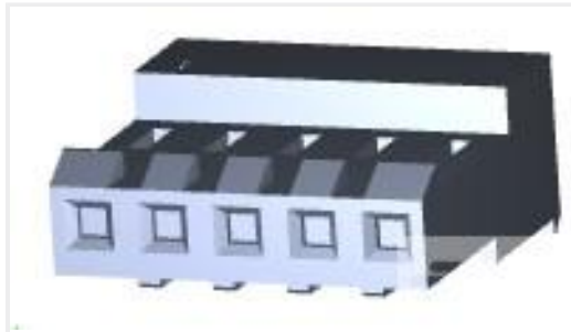
TE Part #3-640426-5 05P MTA156 CONN ASSY 18AWG ORA