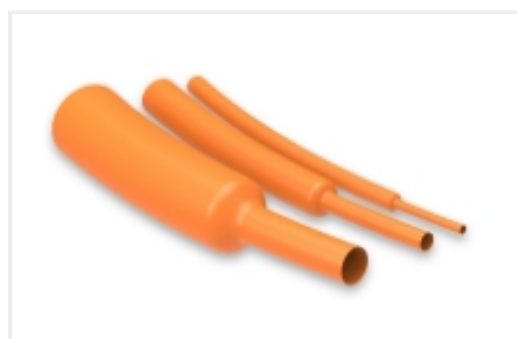
Orange Heat Shrink Tubing(11)