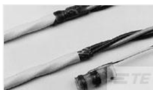
TE Part #393171-000 SO96-1-55-22-90