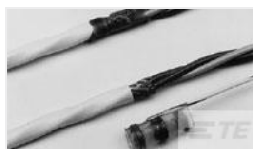
TE Part #201595-000 SO96-2-00