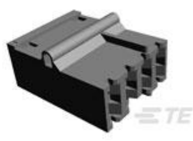
TE Part #928343-6 STD-TIM GEH 6P