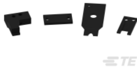
TE Part #690813-1 BLADE, SLUG