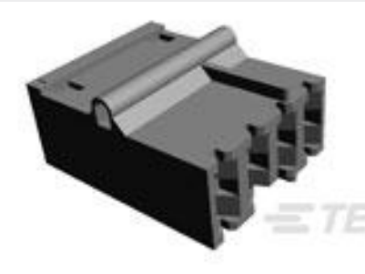
TE Part #928343-5 5P STD-TIMER GEH