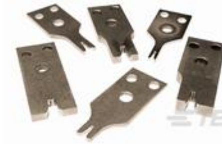
TE Part #879674-1 DRAHT CRIMPER