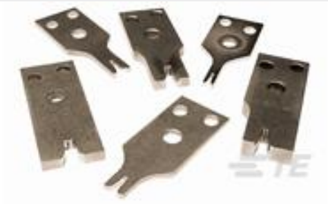
TE Part #3-2119582-4 Crimper, Insulation F Premium