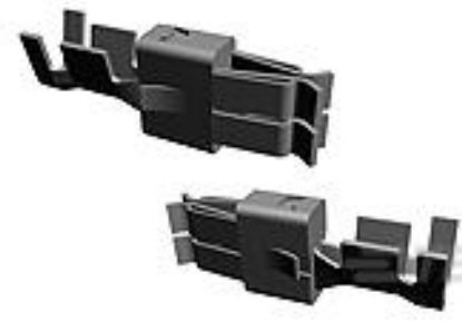
TE Part #927827-2 SPT REC 6.3 Contact SRC Sn