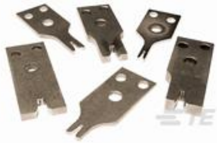
TE Part #456408-5 CRIMPER WIRE .110 F