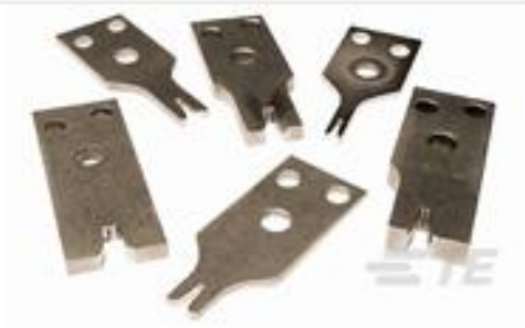
TE Part #690812-1 INSULATION CRIMPER