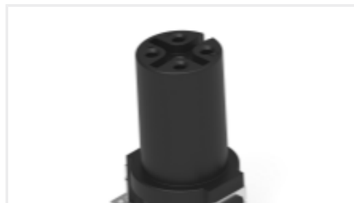
TE Part #354098-E M12 FEMALE, A CODE, 5P, 17MM SMT