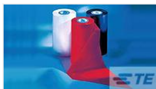
TE Part #310109-000 TMS-101-RIBBON-4RPSCE