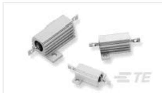
TE Part #4-1879075-7 THS25 680R 5%