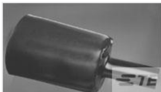
TE Part #CX7200-000 RHW-160/50-1200/ADH-0