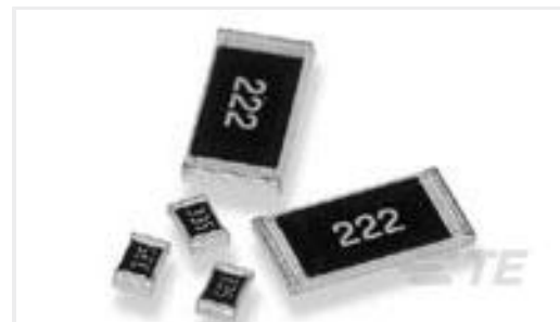
TE Part #1623490-1 CRG1206 1% 33R