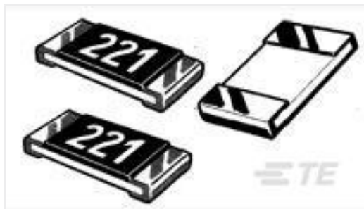
TE Part #3-1622820-5 3520 2R7 5%