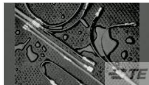
TE Part #596381-000 B-106-1602