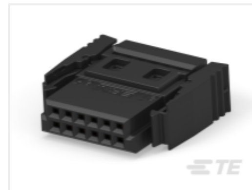
TE Part #214345-E SMCB 12 F AB VV 6-01 VH * 0008 137 E002