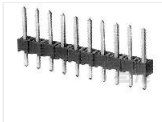
TE Part #2-826629-0 20P AMPMODU II PIN HDR