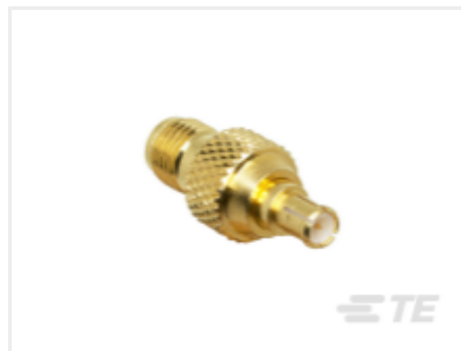
TE Part #ADP-SMAF-MCXM SMA Jack to MCX Plug