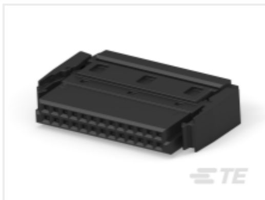
TE Part #214346-E SMCB 26 F AB VV 6-01 VH * 0008 137 E002