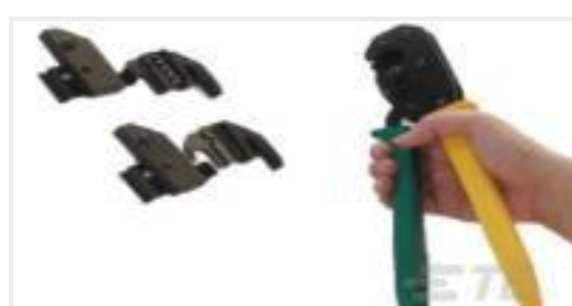
TE Part #169400 CERTI-LOK FRAME W/O DIES