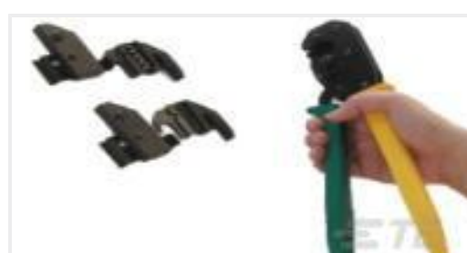
TE Part #169404 CERTI-LOK DIE