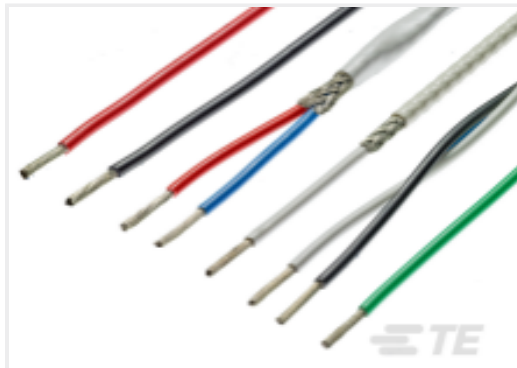
TE Part #758571-000 55A6130-20-9/5-9CS636