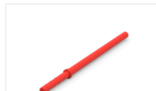
TE Part #0413-216-2005 SEALING PLUG, SIZE 20, KEYING, RED