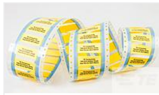
TE Part #8264810001 TMS-SCE-2.5K-3/16-2.0-9