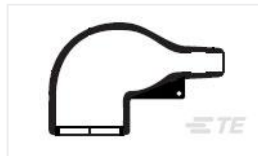
TE Part #878512-000 222K132-25-0