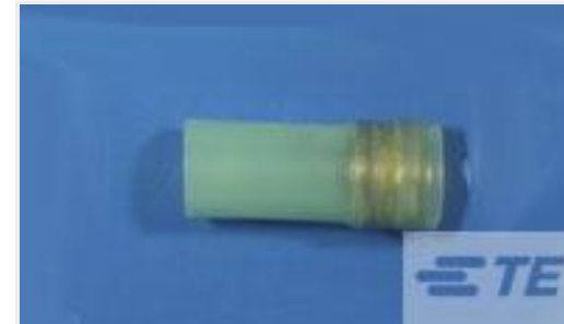
TE Part #359287N001 D-150-1008CS821