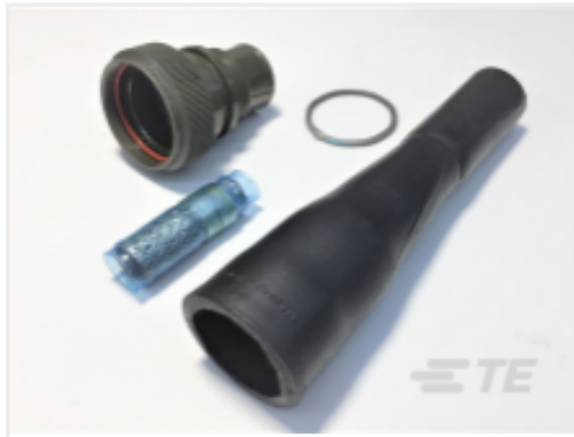
TE Part #571823N001 6120-10-561120-CS2359