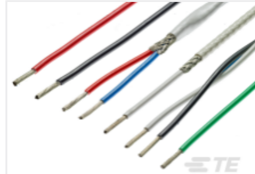
TE Part #3828543001 44A1221-26-2/6-9