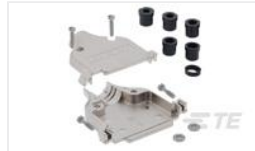
TE Part #5748676-3 DIE CAST CBL CLMP KIT,SZ 3