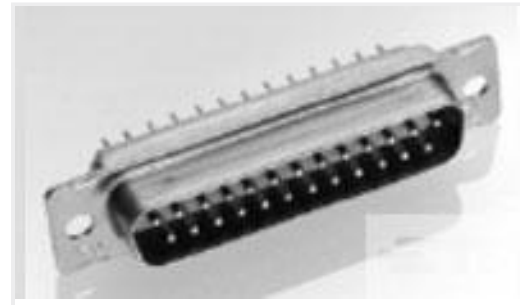
TE Part #1757820-1 AMPLIMITE,ASY,RCPT,STD,109,ZN,1