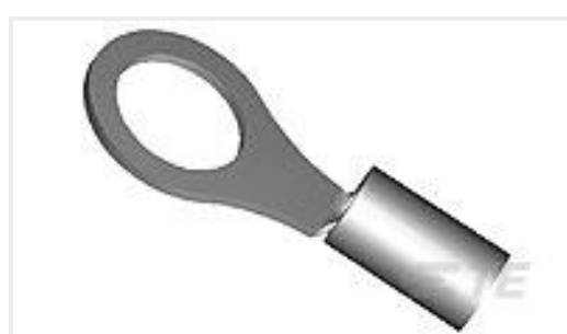
TE Part #322805 TERMINAL,SOLIS R HR 16-14 6