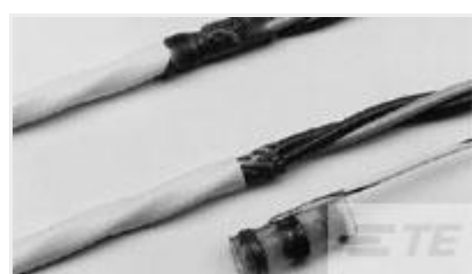
TE Part #158357-000 CWT-11-S