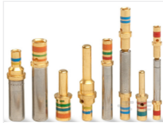
TE Part #ZPF0000000000005184 910 KS 20 R