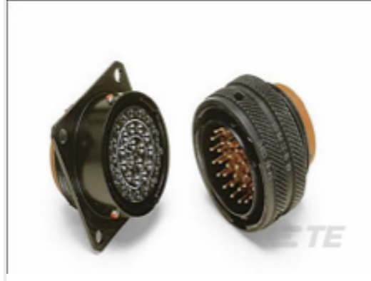
TE Part #ZPF0000000000005397 910-6F 20-41 PN 01