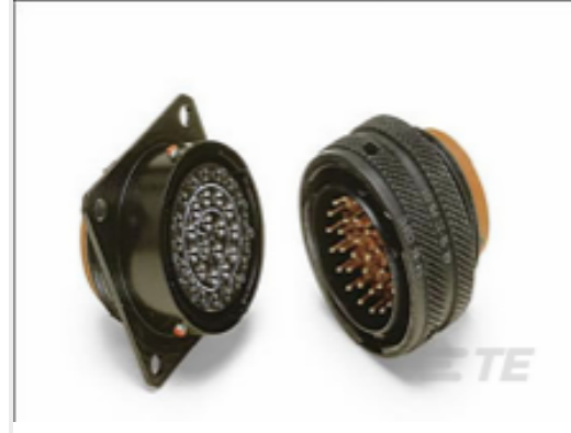
TE Part #ZPF0000000000005387 910-6F 10-06 SN 01