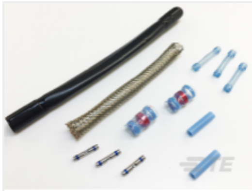
TE Part #CU1642-000 D-200-0234-RT