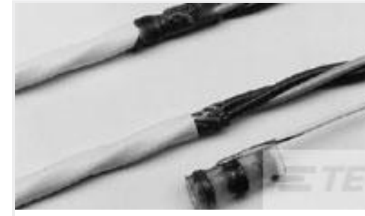
TE Part #163665N003 S02-07-RCS453