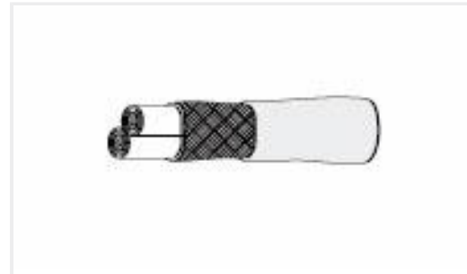
TE Part #353785-000 55A1121-24-9/96-9CS2275