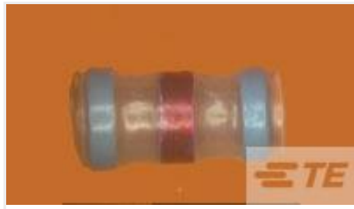
TE Part #622012-000 D-144-12