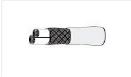
TE Part #466345-000 55A1131-24-MST3-9CS2275