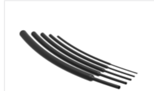
TE Part #NB17932001 RNF-100-1-1/2-BK-STK