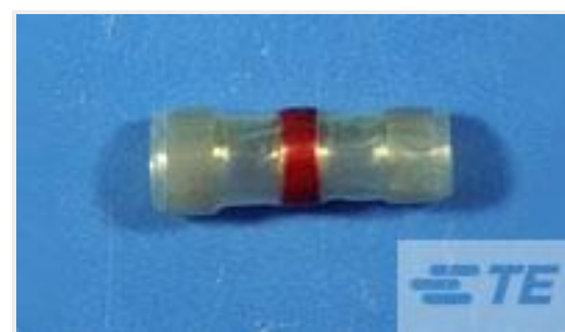
TE Part #750648N001 D-1744-03CS378