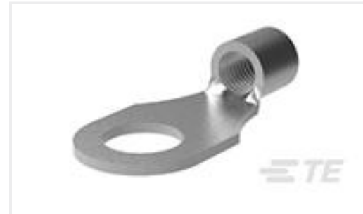
TE Part #321878 TERMINAL,SOLIS R 4/0 3/8