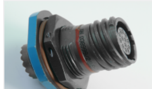
TE Part #YDTS24W17-08SNV001 RECP ASSY