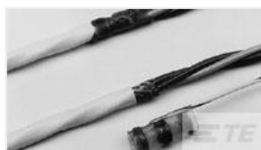
TE Part #115204-000 D-146-0206