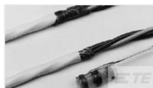
TE Part #624512-000 D-146-0207