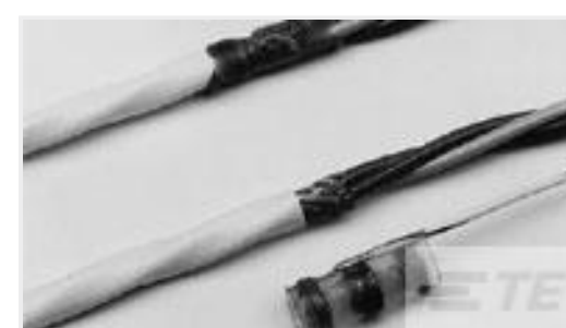
TE Part #482943-000 SO63-4-9030