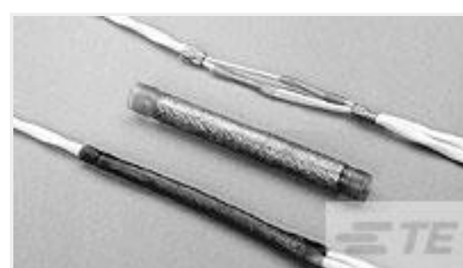
TE Part #621207-000 D-150-0174