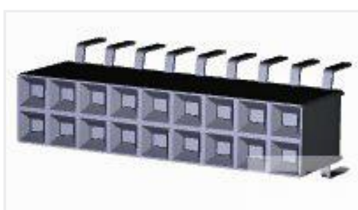
TE Part #1-534267-0 18 MODIV VRT DR OE 100/125