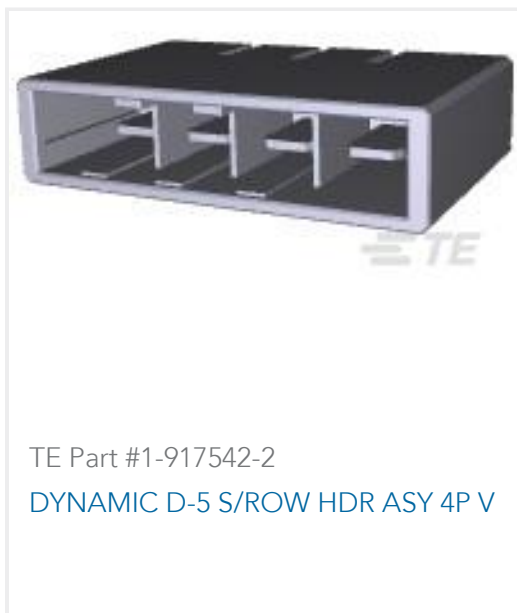
TE Part #1-917542-2 DYNAMIC D-5 S/ROW HDR ASY 4P V