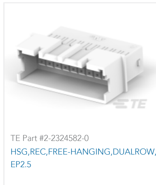
TE Part #2-2324582-0 HSG,REC,FREE-HANGING,DUALROW, EP2.5