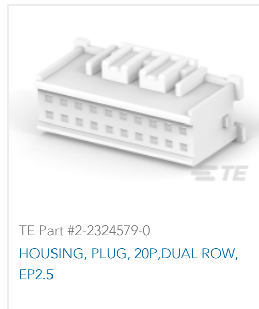
TE Part #2-2324579-0 HOUSING, PLUG, 20P,DUAL ROW, EP2.5