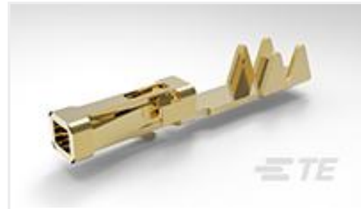
TE Part #487406-2 FFC RCPT CONT SP 30AU RL