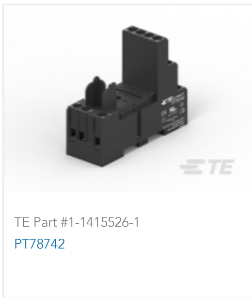
TE Part #1-1415526-1 PT78742