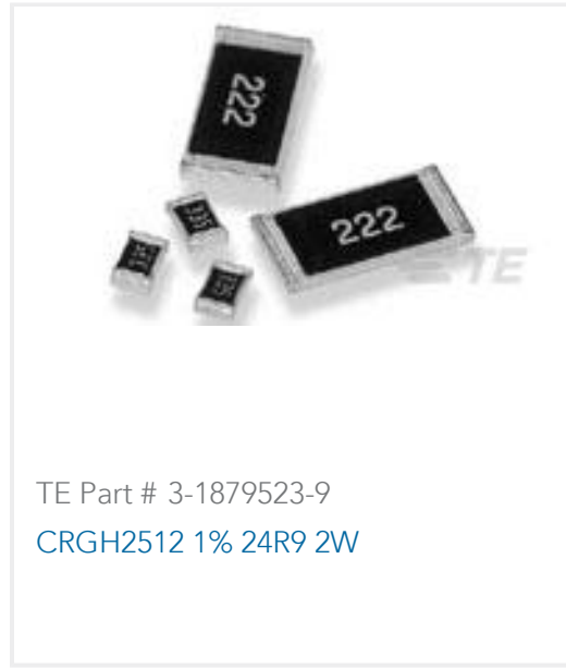
TE Part # 3-1879523-9 CRGH2512 1% 24R9 2W