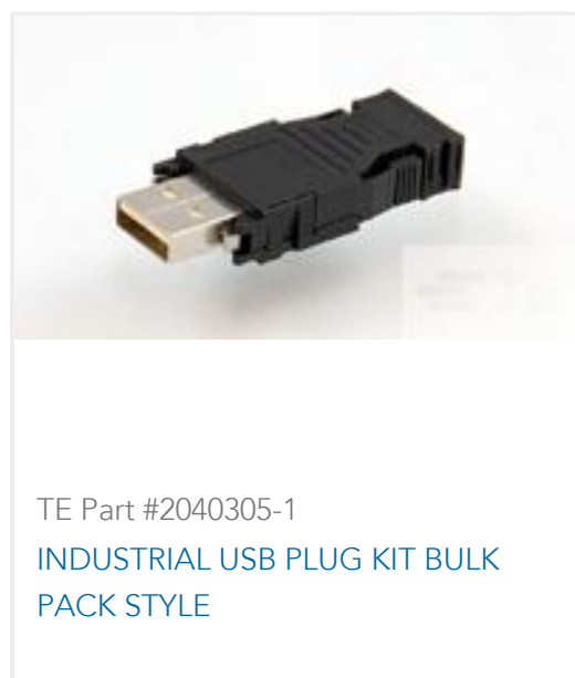
TE Part #2040305-1 INDUSTRIAL USB PLUG KIT BULK PACK STYLE