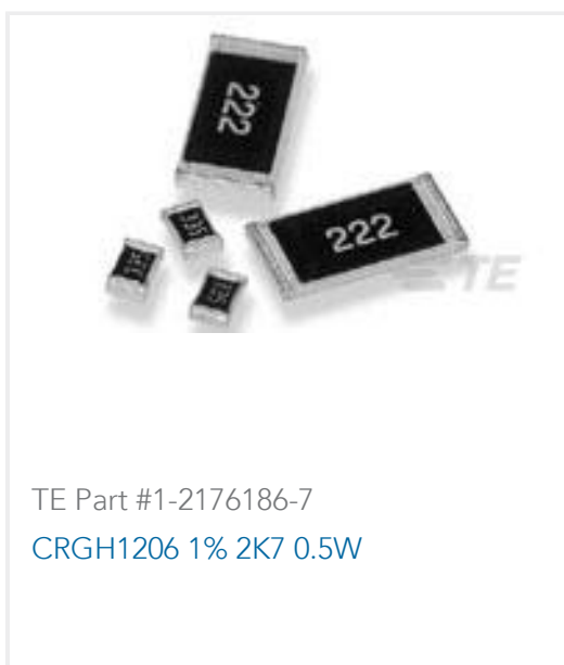
TE Part #1-2176186-7 CRGH1206 1% 2K7 0.5W