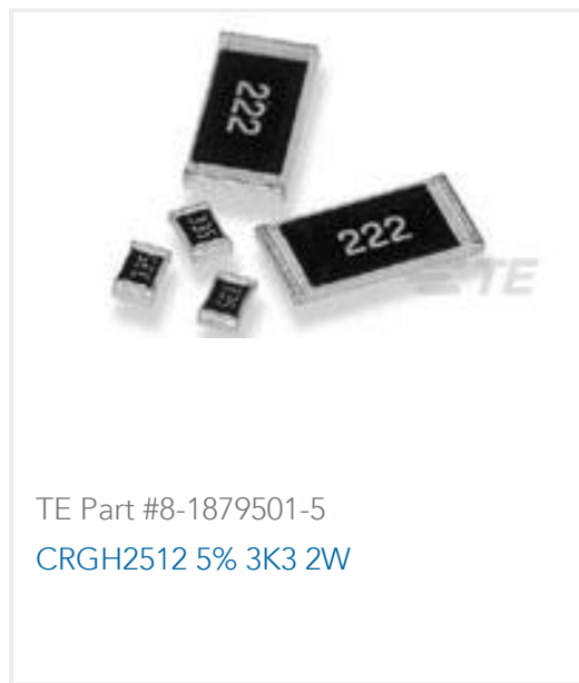
TE Part #8-1879501-5 CRGH2512 5% 3K3 2W