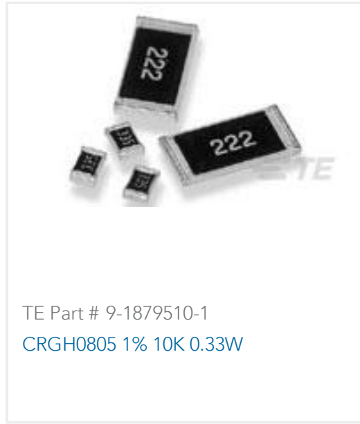
TE Part # 9-1879510-1 CRGH0805 1% 10K 0.33W