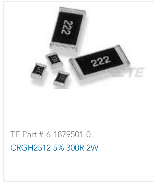
TE Part # 6-1879501-0 CRGH2512 5% 300R 2W