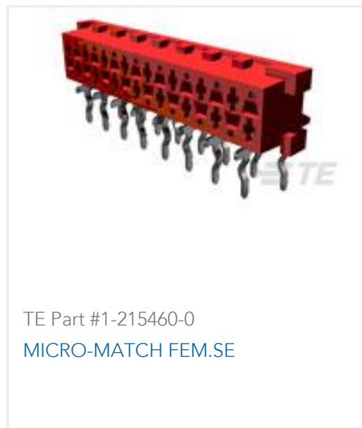
TE Part #1-215460-0 MICRO-MATCH FEM.SE