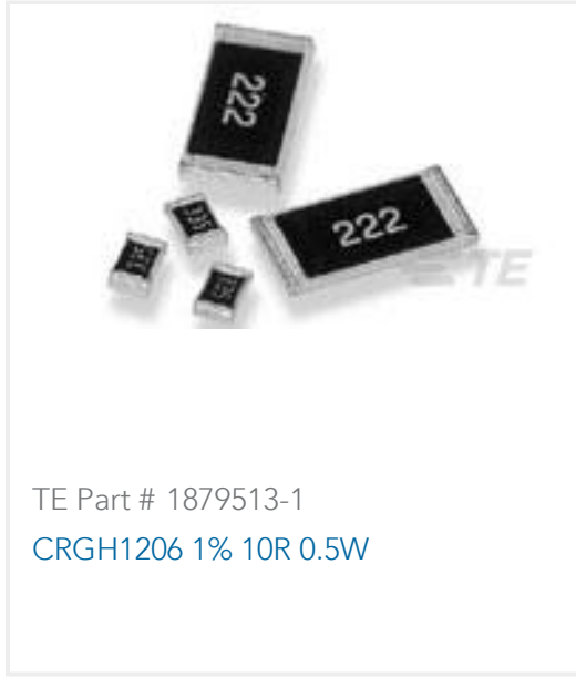
TE Part # 1879513-1 CRGH1206 1% 10R 0.5W