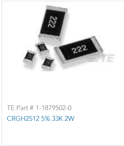
TE Part # 1-1879502-0 CRGH2512 5% 33K 2W