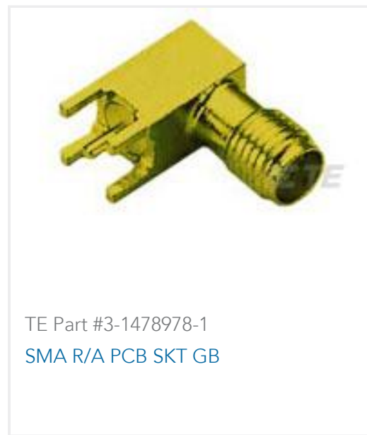
TE Part #3-1478978-1 SMA R/A PCB SKT GB