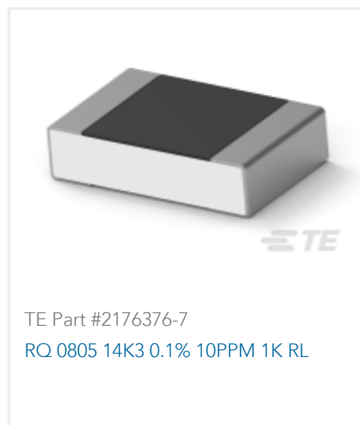
TE Part #2176376-7 RQ 0805 14K3 0.1% 10PPM 1K RL