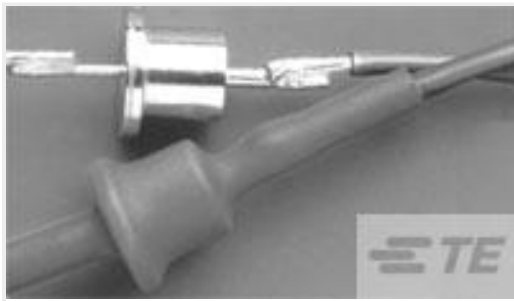
TE Part #5677572005 RNF-3000-6/2-0-STK