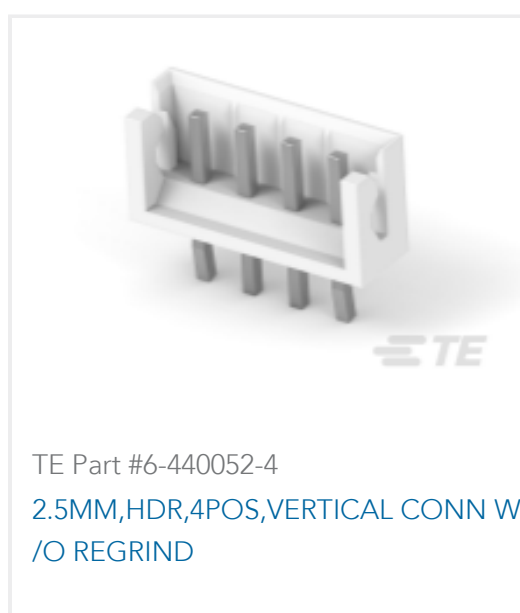
TE Part #6-440052-4 2.5MM,HDR,4POS,VERTICAL CONN W /O REGRIND