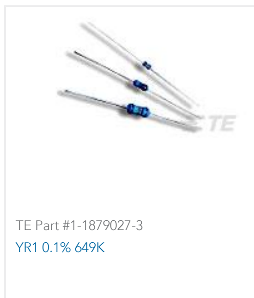
TE Part #1-1879027-3 YR1 0.1% 649K