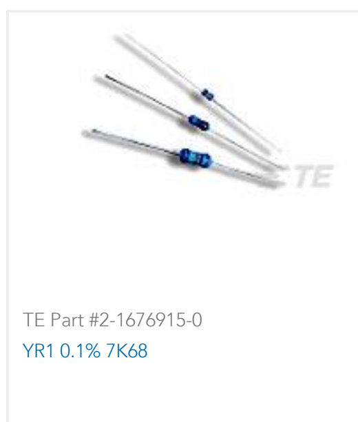
TE Part #2-1676915-0 YR1 0.1% 7K68