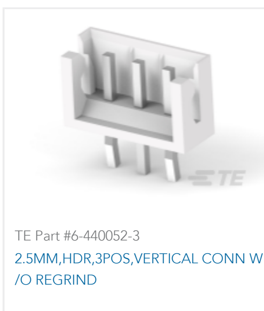
TE Part #6-440052-3 2.5MM,HDR,3POS,VERTICAL CONN W /O REGRIND