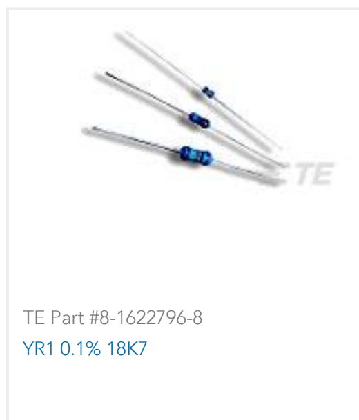
TE Part #8-1622796-8 YR1 0.1% 18K7