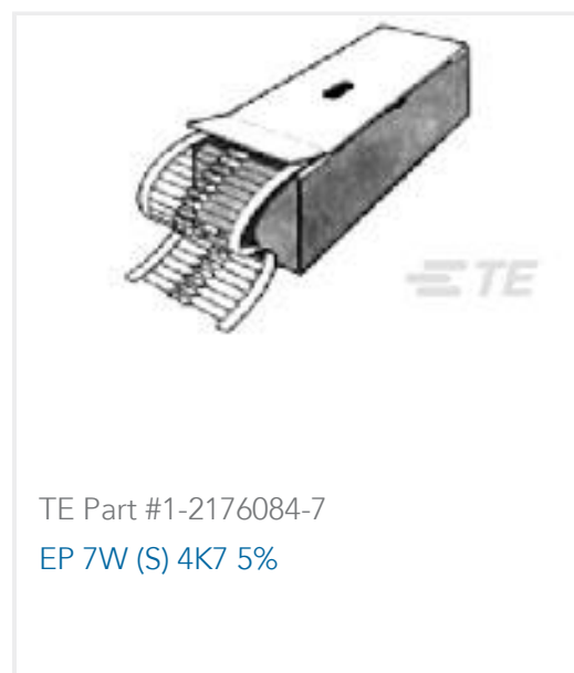
TE Part #1-2176084-7 EP 7W (S) 4K7 5%