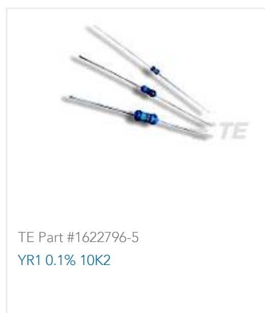
TE Part #1622796-5 YR1 0.1% 10K2