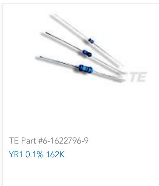
TE Part #6-1622796-9 YR1 0.1% 162K