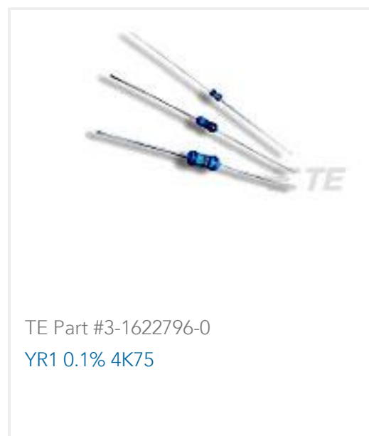
TE Part #3-1622796-0 YR1 0.1% 4K75