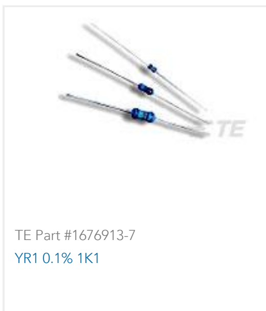
TE Part #1676913-7 YR1 0.1% 1K1