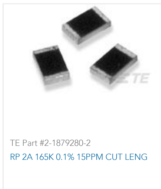
TE Part #2-1879280-2 RP 2A 165K 0.1% 15PPM CUT LENG