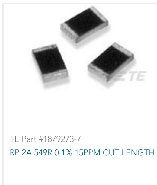
TE Part #1879273-7 RP 2A 549R 0.1% 15PPM CUT LENGTH