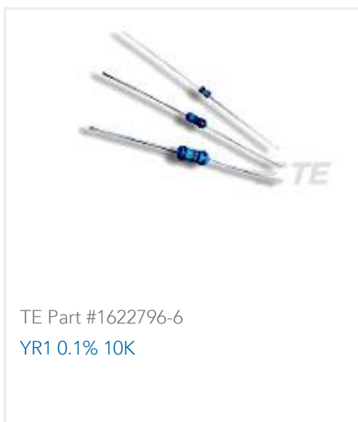
TE Part #1622796-6 YR1 0.1% 10K