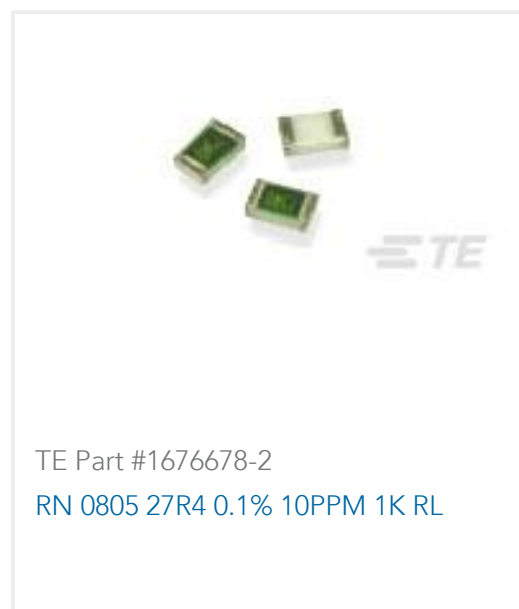
TE Part #1676678-2 RN 0805 27R4 0.1% 10PPM 1K RL