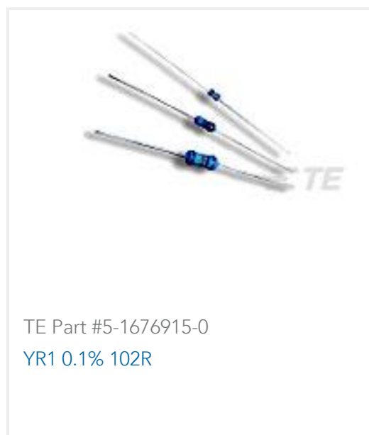
TE Part #5-1676915-0 YR1 0.1% 102R