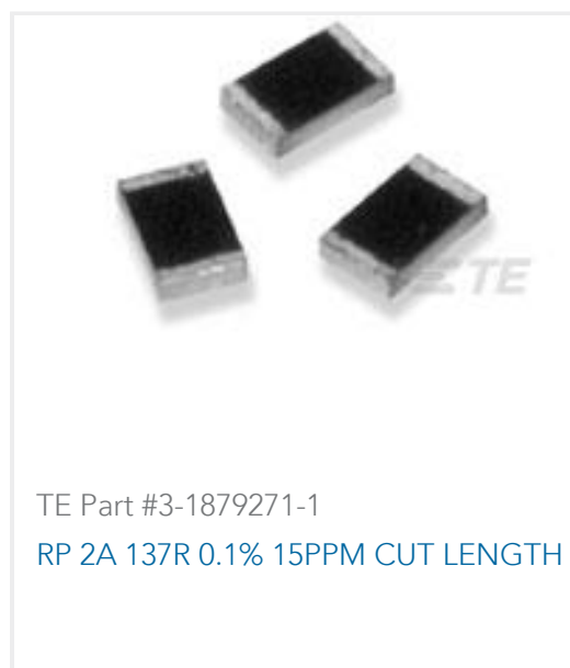
TE Part #3-1879271-1 RP 2A 137R 0.1% 15PPM CUT LENGTH