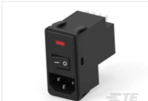
TE Part #4-6609951-3 PS0SXD SX0=C4457