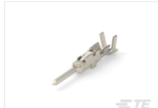
TE Part #2367820-2 DYNAMIC D1000SL TAB CONT M SIZE AU0.2 LP