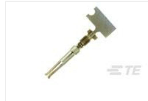
TE Part #66504-9 SOCKET CONTACT, 20 DF