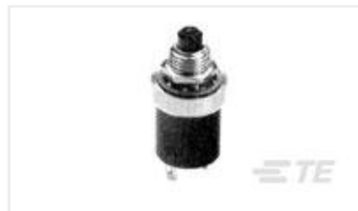
TE Part #1825516-2 MSP103C04