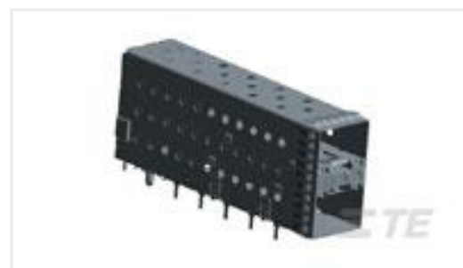
TE Part #1-2007492-5 SFP+assy 2x1 EMI Springs 4LP Sn Enhanced