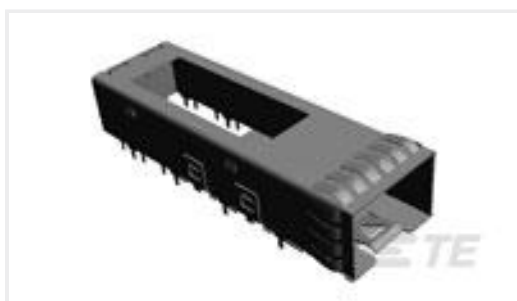
TE Part #2110304-1 SFP+ 1x1 Cage Assembly, Solder Tail