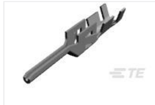
TE Part #1-794612-2 PIN CONT 20-24 30 GOLD L/P