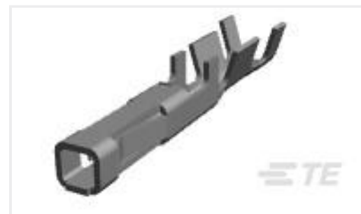
TE Part #1-794610-2 MICRO MNL RPT CNT,LS PC 30AU L