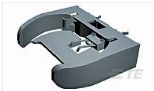
TE Part #1775485-1 Battery Holder, 3.6mm, BLK, low profile