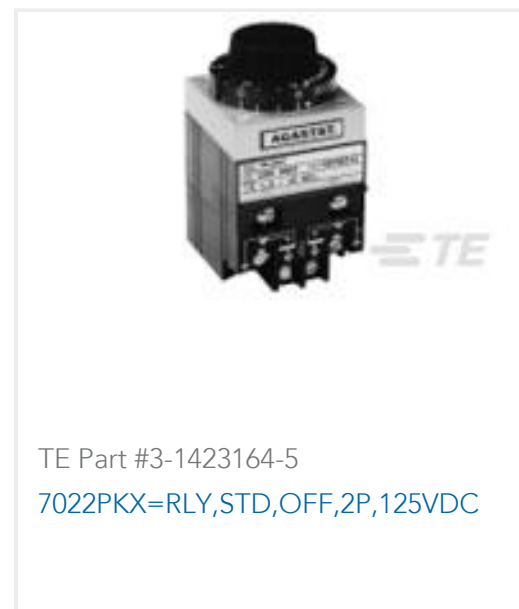
TE Part #3-1423164-5 7022PKX=RLY,STD,OFF,2P,125VDC