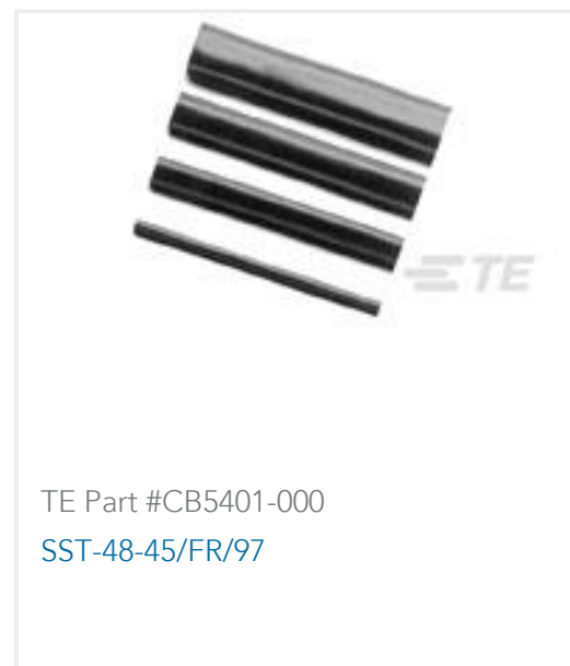
TE Part #CB5401-000 SST-48-45/FR/97