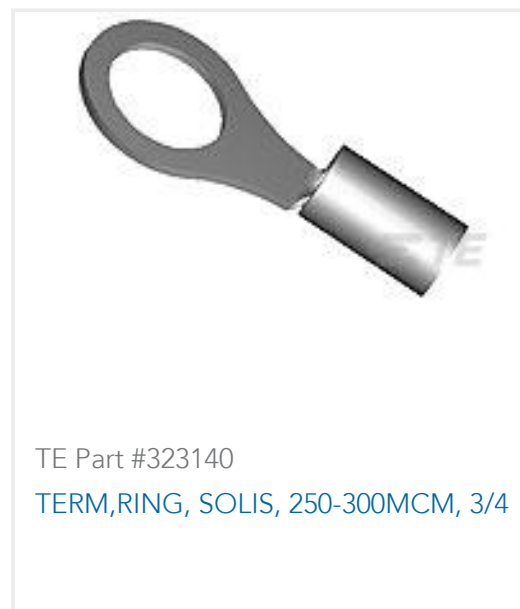
TE Part #323140 TERM,RING, SOLIS, 250-300MCM, 3/4