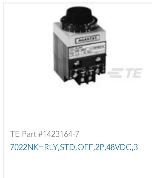
TE Part #1423164-7 7022NK=RLY,STD,OFF,2P,48VDC,3