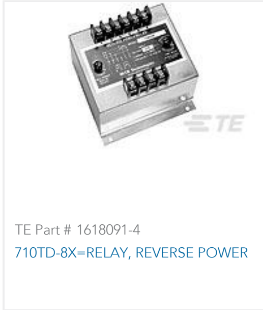
TE Part # 1618091-4 710TD-8X=RELAY, REVERSE POWER