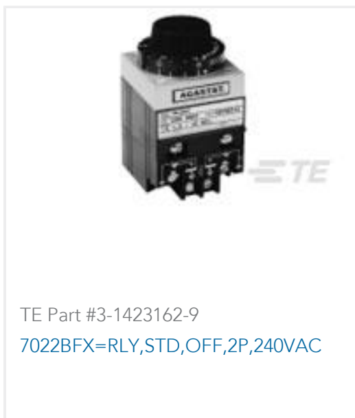
TE Part #3-1423162-9 7022BFX=RLY,STD,OFF,2P,240VAC