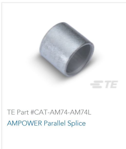
TE Part #CAT-AM74-AM74L AMPPOWER Parallel Splice