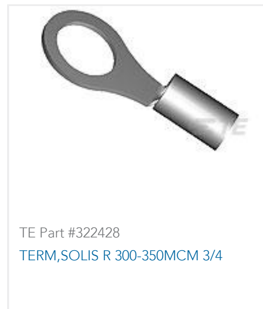
TE Part #322428 TERM,SOLIS R 300-350MCM 3/4