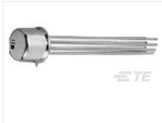
TE Part #9-1617352-8 JMACT-9XP=M28776/1-027P