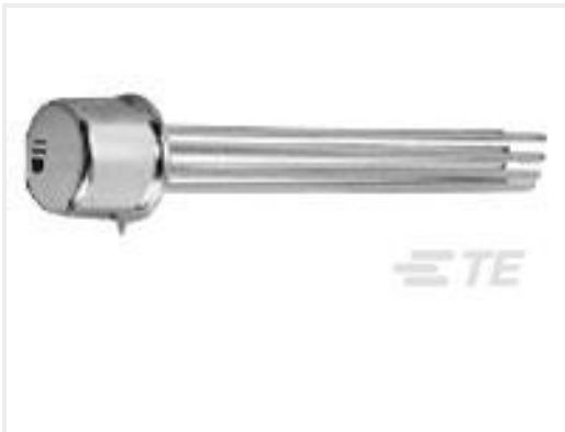
TE Part #2-1617164-3 JMAPT-5XP = M28776/1-019P