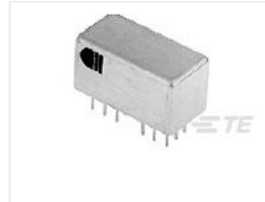
TE Part #5-1617090-7 LS-9521L = DPDT LATCHING RELAY