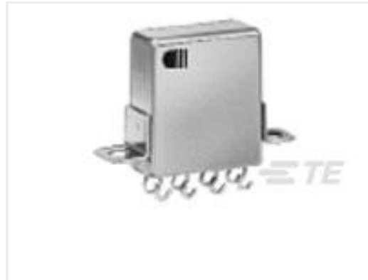
TE Part #3-1617020-2 FW1301G02 = M5757/10-053