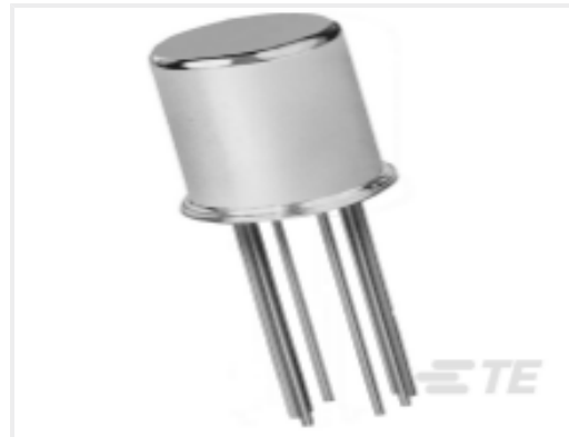
TE Part #1617542-5 JMACD-9XP=M39016/15-078P