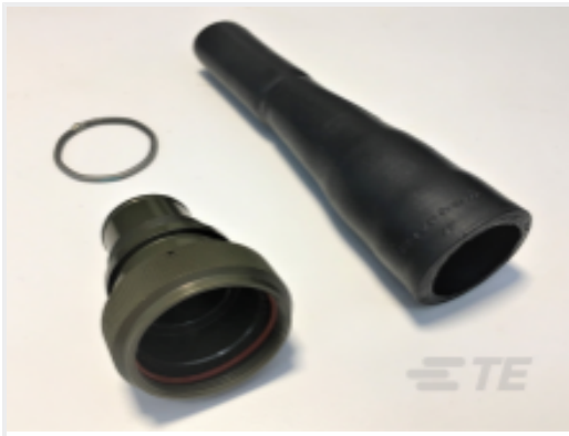
TE Part #024953N001 202D263-4-61/42-0-CS5077