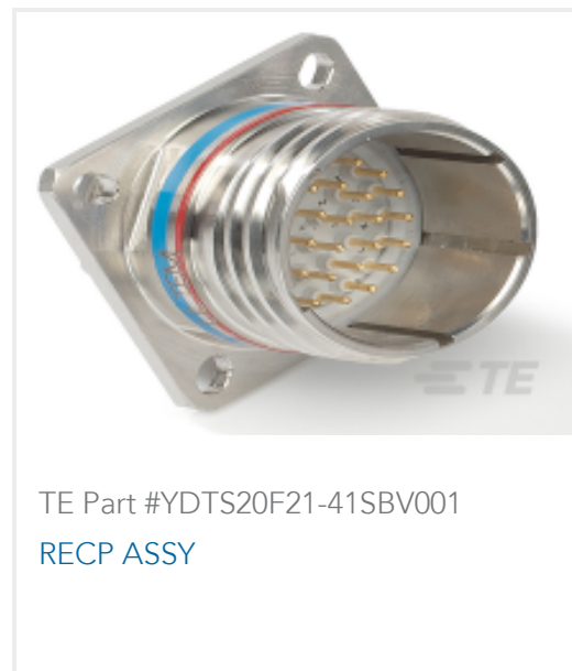
TE Part #YDTS20F21-41SBV001 RECP ASSY