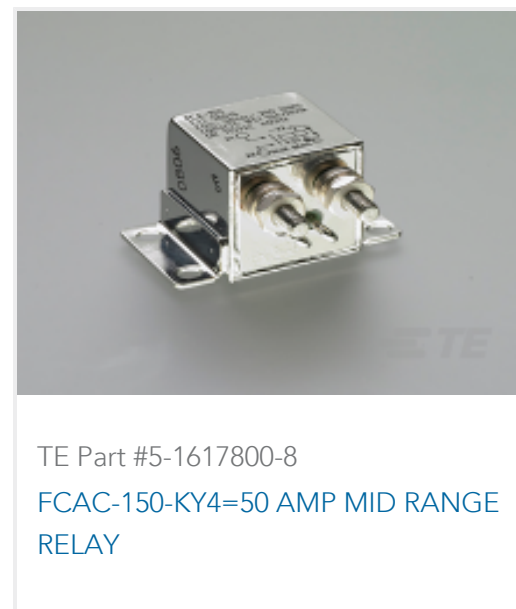
TE Part #5-1617800-8 FCAC-150-KY4=50 AMP MID RANGE RELAY