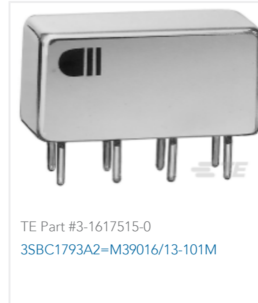
TE Part #3-1617515-0 3SBC1793A2=M39016/13-101M