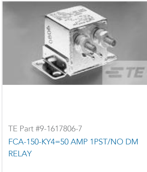
TE Part #9-1617806-7 FCA-150-KY4=50 AMP 1PST/NO DM RELAY