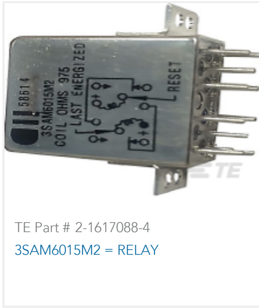
TE Part # 2-1617088-4 3SAM6015M2 = RELAY