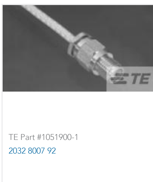
TE Part #1051900-1 2032 8007 92