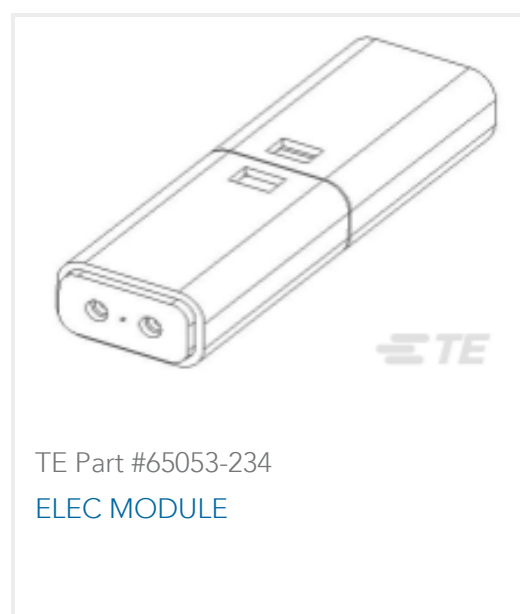
TE Part #65053-234 ELEC MODULE