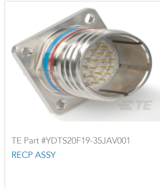
TE Part #YDTS20F19-35JAV001 RECP ASSY