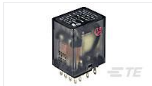
TE Part #3-1393122-9 KHAU-17A18-120=KH