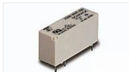
TE Part #3-1393222-9 V23061A1007A302=MINISTARKSTROM