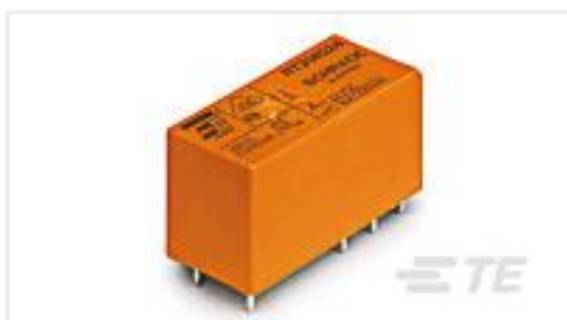
TE Part #1-1393243-0 RTE24024