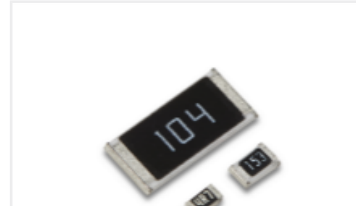
TE Part #2176347-6 CRGCQ 2010 27R 1%