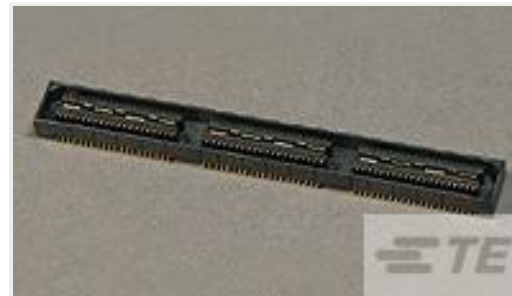
TE Part #2-1658012-3 MSB0.80RC-ASY120FL,-,10,-TY