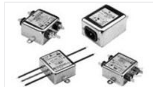
TE Part #1-6609027-5 10EK7=F7095 S0