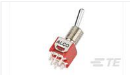
TE Part #2267077-1 TMS1T4B5M2RE