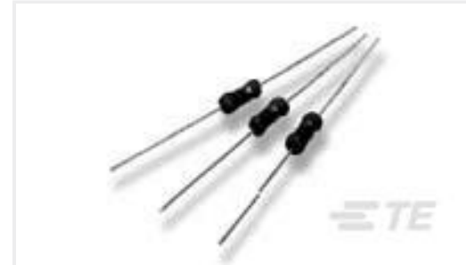
TE Part #9-1879352-1 RR02 5% 1K8 AMMO