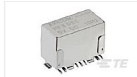
TE Part #3-1462051-1 HF3 56S = 50OHM 140MW 12V MONO