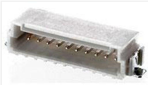
TE Part #1-292228-6 1.5 MINI CT SGL H SMT W/O BOSS