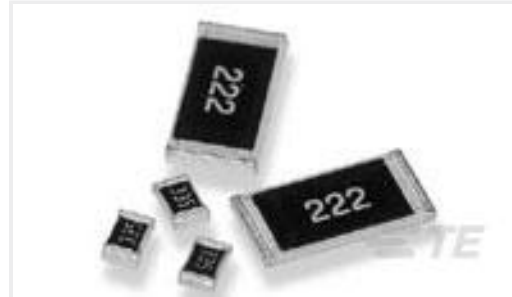
TE Part #4-1879499-9 CRGH2010 5% 100R 1W