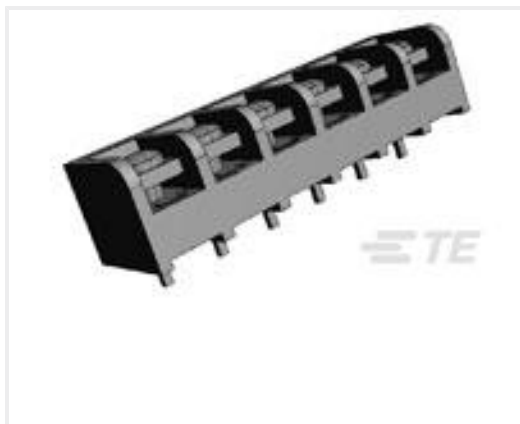
TE Part #8-1437648-0 4PCV-06-006=4PCV ASSEMBLY