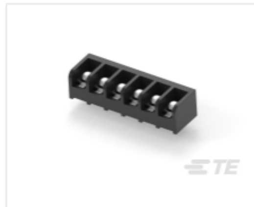
TE Part #3-1437650-2 4PCV-06-391=4PCV-06-391 4PCV A