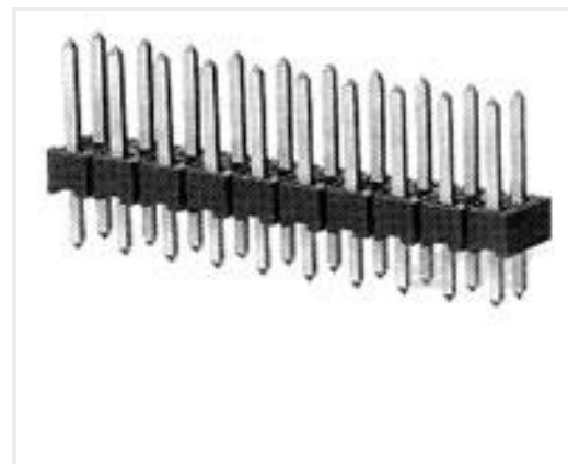
TE Part #6-146252-2 24 MODII HDR DRST B/A .100 LF