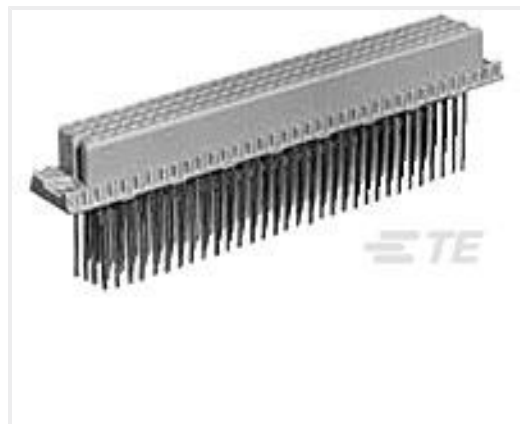
TE Part #216415-4 128P.IEC-C FEM.CONN