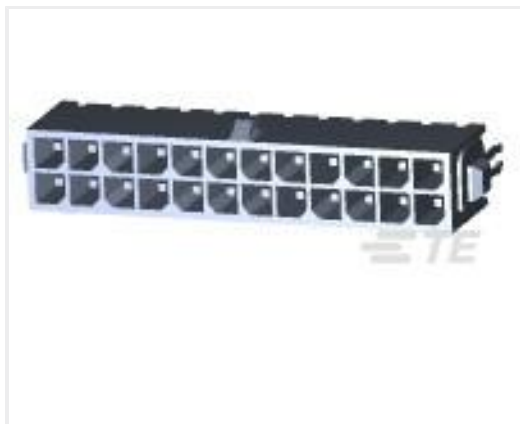
TE Part #5-794682-4 24P MICRO MNL ASSY,VRT,THRU,L