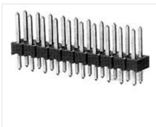
TE Part #9-146255-0 80 MODII HDR DRST B/A .100 LF