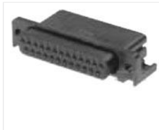
TE Part #747461-1 25 APFL RCPT RA 590