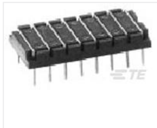
TE Part #2-1437507-1 8136-475G9=JUMPER PLUG ASSY