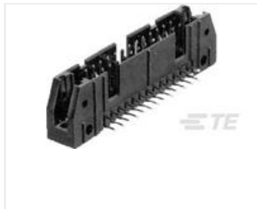
TE Part #1-102159-0 050 UNIV HDR RA 4S 15DP STD